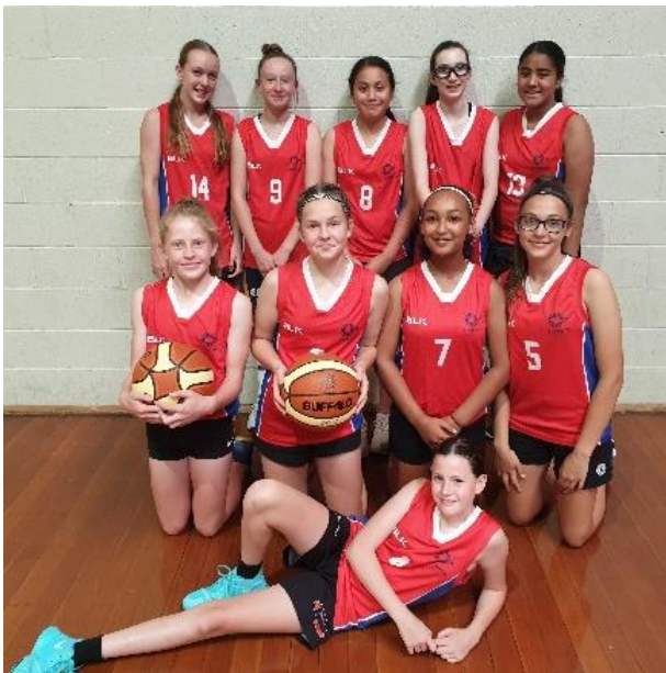
Yr. 7/8 Girls Harrison School Basketball Team